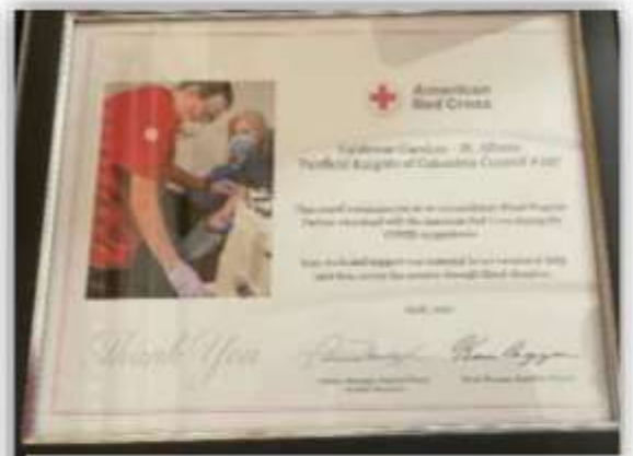
American Red Cross recognizes Council 297 as an extraordinary Blood Drive partner